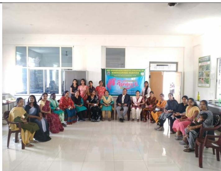
Photo session with the AD and women staff