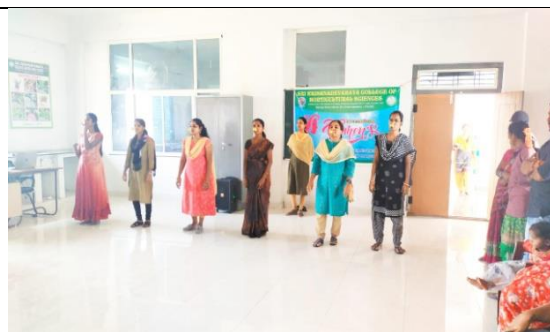
Lemon and spoon game