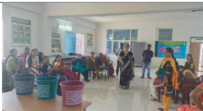
Ball in the bucket