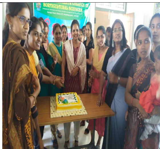
Cake cutting with women staff