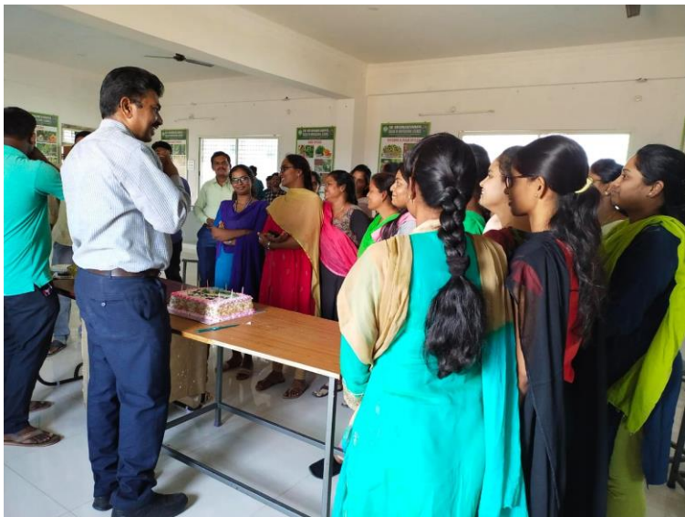
Cake cutting by chief guest

On this occasion, there were various events of celebrations and deliberations performed by the students of the college. Girls students also shared their views on woman empowerment and ongoing scenarios.